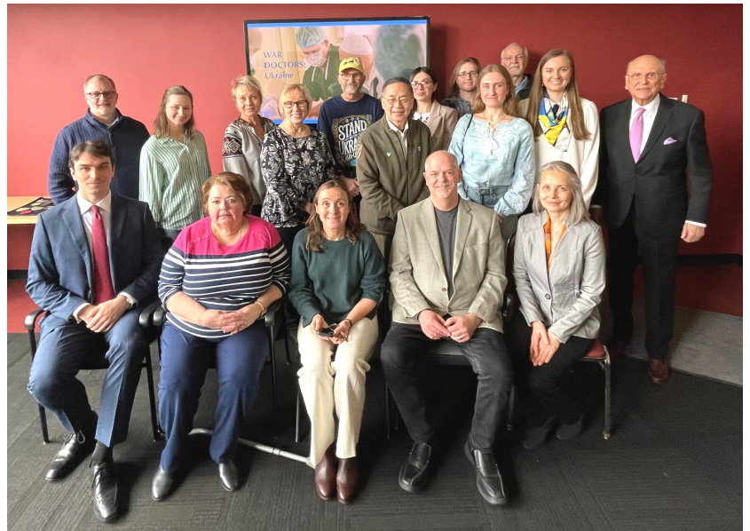
Pennsylvania Branch members and guests